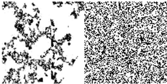
Figure 3: The left image is the texture on the target floor regions in the evolutionary robotics experiment; the right image is the random point texture on the rest of the arena floor. Both patterns have the same percentage of black pixels (36%). The method outlined in Section 6.3 discriminates between these two patterns.

The experiment described in this section was performed in a modified version of the Evorobot simulator (Nolfi, 2000). This software simulates a Khepera robot (Mondada et al., 1993) acting in user specified environments that can comprise of walls, large and small round objects and lights. Sensor readings taken from a physical Khepera robot are used to model the environment/sensor interactions.